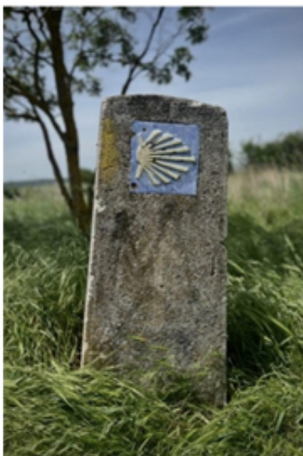
Signpost on the Camino – France